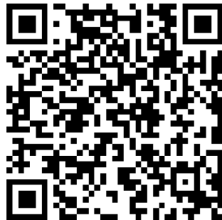
QR code for registration system

URL: http://rard.igsnr.ac.cn/hyxt/hyzt/ .