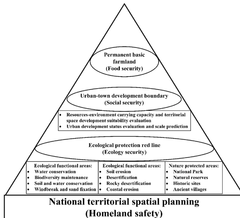
Fig. 2. Three bottom lines for China's national territorial spatial planning.

Undoubtedly, the establishment of national territorial spatial planning system will be of milestone significance for China's space governance and play an extremely important guiding role in the preparation,